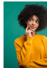
Freedom Certificate: Your Frequently Asked Questions Answered