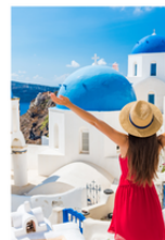
Holiday Travel on a Dime: Budgeting Tips for End-of-Year Vacations