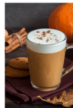
Pumpkin Spice & Personal Finance: Fun Money Facts about Your Favorite Fall Treats