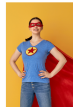
The Freedom Certificate: Las Colinas FCU's Force for Good in the World of Banking